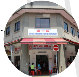
Tan Ser Seng Herbs Restaurant