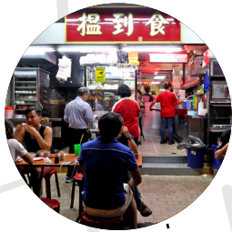
126 Dim Sum Wen Dao Shi