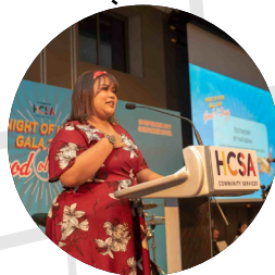
HSCA Community Services