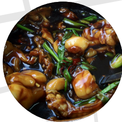
Eminent Frog Porridge