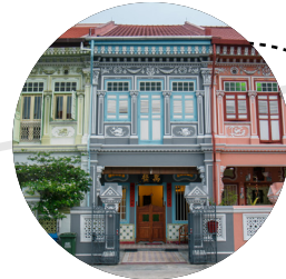
Peranakan Shophouses along Sims Avenue & Tan Ser Seng