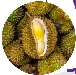
Ah Hung D24 Sultan Durian