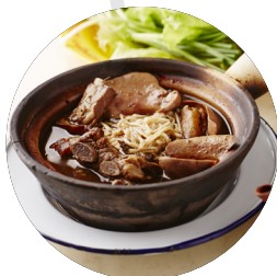
Leong Kee (Klang) Bah Ku Teh