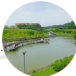
Punggol Waterway park