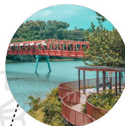
Lorong Halus Wetlands