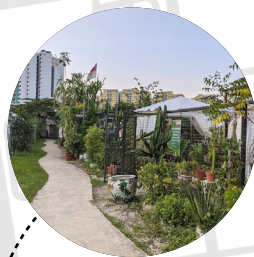
Punggol Container Park