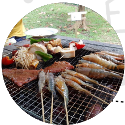
Hai Bin Prawning